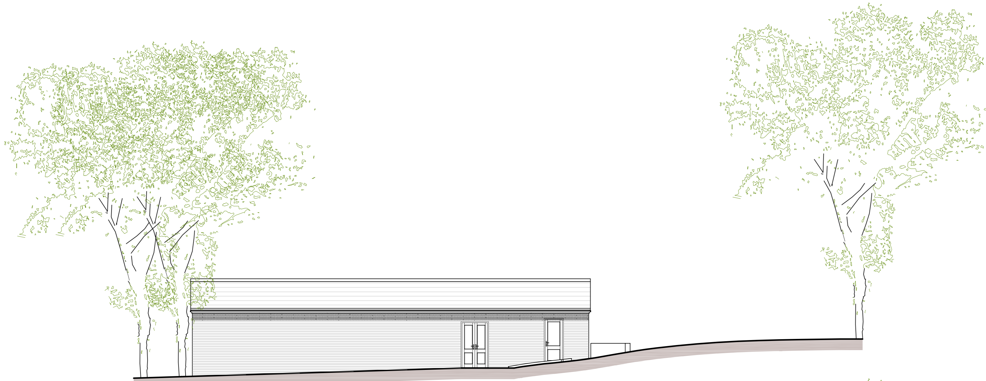
SITE SECTION EXISTING