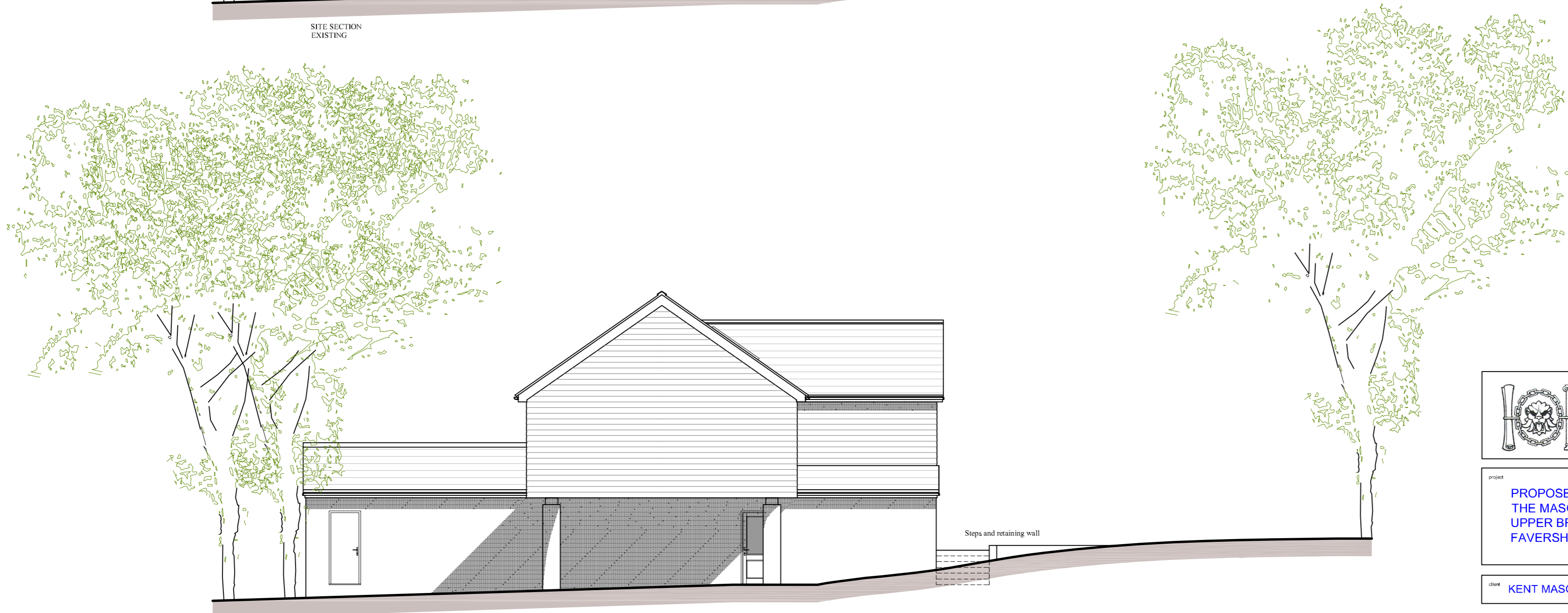
SITE SECTION PROPOSED